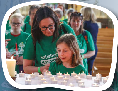
Celebration Walk Page 11