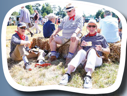
Salisbury Summer Fair Page 13