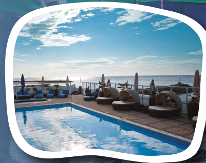
Summer Raffle Page 4